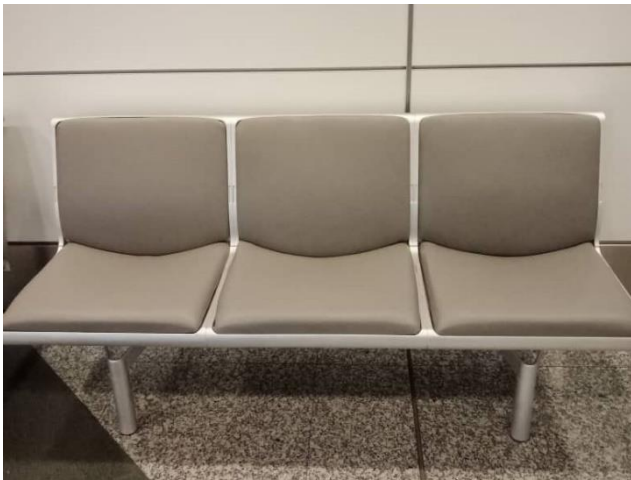
Chairs delivered to KLIA