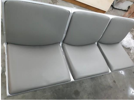
Ready for delivery to KLIA