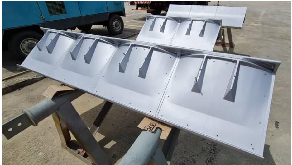
After application of the ALU ZM layer