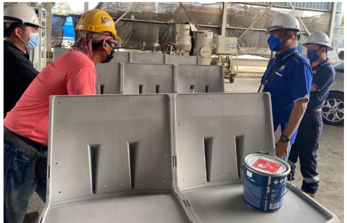
Quality control of the surface preparation before application of the 1st ZINGA layer.