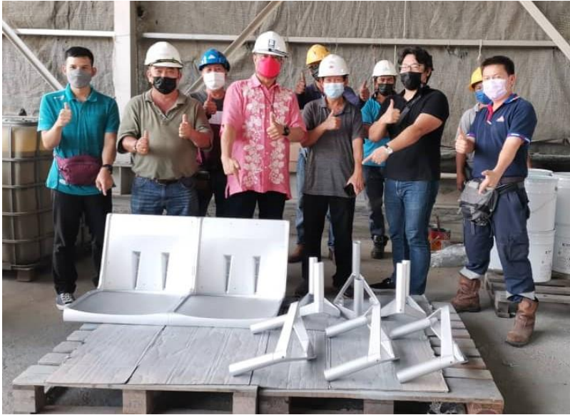
(above) The ZINGAMETALL Johor Team